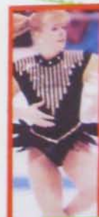
Tonya Harding figure skater