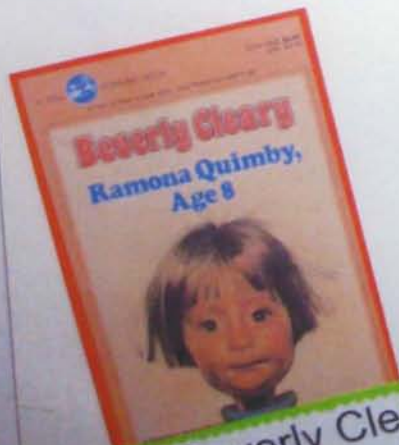
Beverly Cleary of Ramona Quimby books