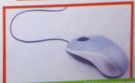
Douglas Engelbart inventor of the computer mouse