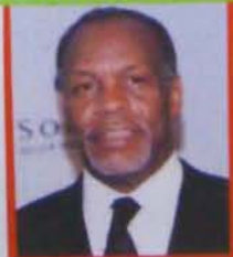
Danny Glover actor