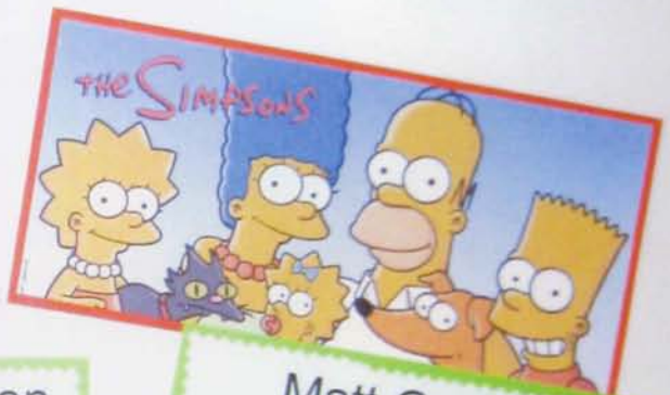
Matt Groening creator of "The Simpsons"