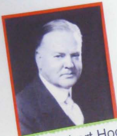
Herbert Hoover 31st President of the United States