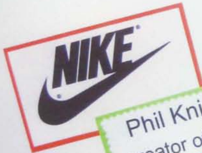
Phil Knight creator of Nike